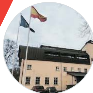
SPANISH EMBASSY IN SWEDEN

The “Escuelas Oficiales de Idiomas” are public schools devoted to teaching foreign languages to the adult population. Spanish as a foreign language is also taught in most schools sited in sizeable cities across the country. Most classes are in the late afternoon and evening, so it is easy to attend. You can improve your Spanish skills for a very reasonable fee. They are managed at a regional level, so all the information about the schools near you is on the website of the Education Authority of the “Comunidad Autónoma”.